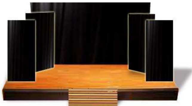
Palco - Stage

PS. La band richiede un tecnico audio e un tecnico luci a carico dell'organizzazione The band asks for a sound and a light engineer provided by the organisation of the event